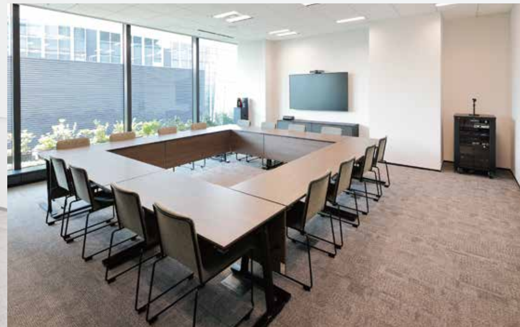
Breakout Room (Medium Room)