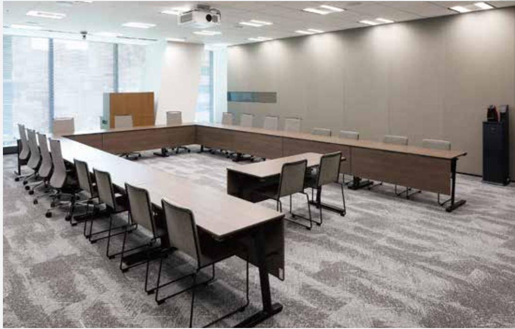
Hearing Room (Main Room)