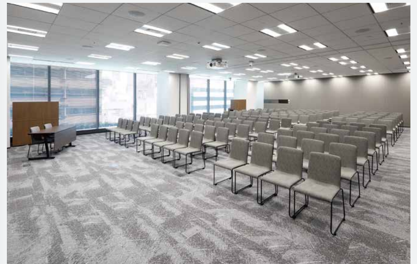
Hearing Room (Main Room)(for Seminar)