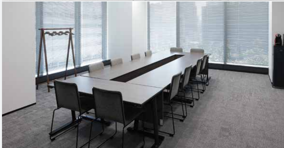
Breakout Room (Small Room)