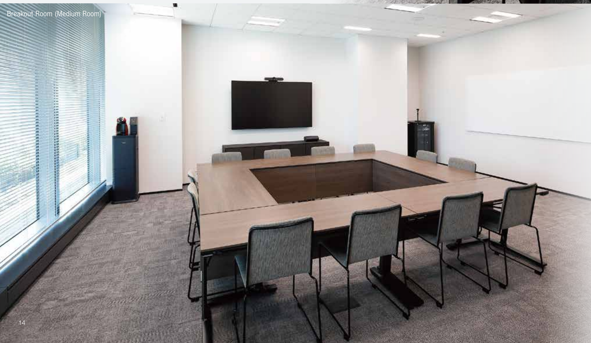
Breakout Room (Medium Room)