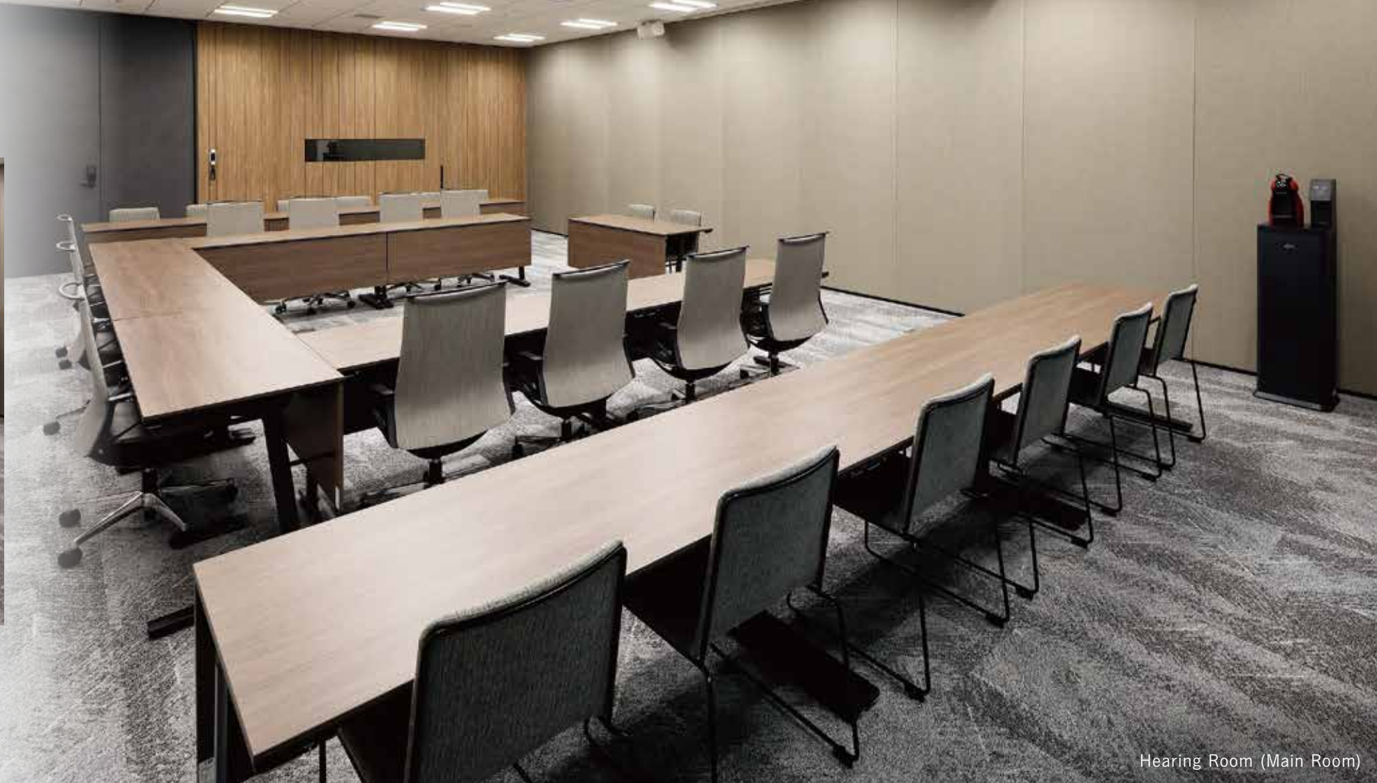
Hearing Room (Main Room)